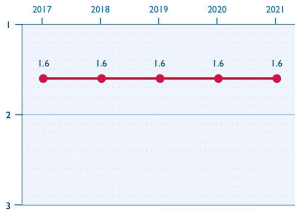
SECTORAL INFRASTRUCTURE IN ESTONIA

According to the 2019 National Civil Society Strategy Impact Evaluation, 69 percent of CSOs have permanent partnerships. CSOs most frequently cooperate with local governments (40 percent of CSOs report such cooperation) and with other associations (reported by 39 percent of CSOs). Sixteen percent of organizations have partnerships with businesses.